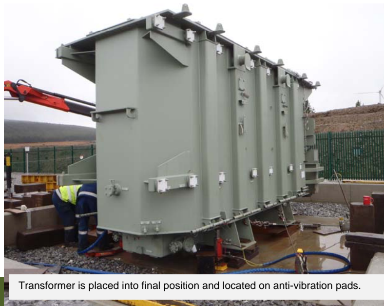
Transformer is placed into final position and located on anti-vibration pads.

Location: Boggeragh, Ireland Project: Offloading & placement to plinth of transformer. Dimensions: 7000mm x 2380mm x 3680mm, 85,175kg. Challenge: Wind farm substation. Equipment: Runway beams, skates, hydraulic jacks.