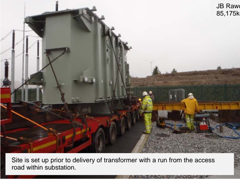
Site is set up prior to delivery of transformer with a run from the access road within substation.

JB Rawcliffe & Sons Ltd. completed the offloading and placement to plinth of a 85,175kg Transformer by jacking and skating.