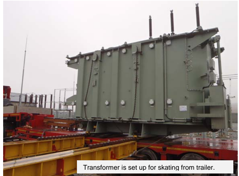
Transformer is set up for skating from trailer.