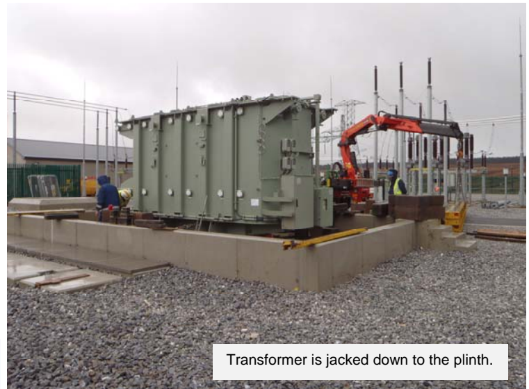
Transformer is jacked down to the plinth.